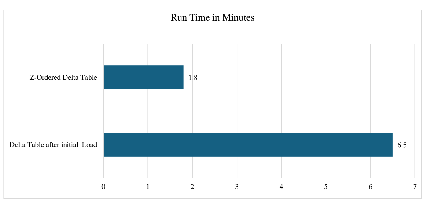
Fig. 2 Performance comparison: z-ordered delta table vs. initial load delta table (run time in minutes)

By using Z-Ordering, query performance can be significantly improved, as it increases the likelihood that unnecessary data can be skipped, making queries run faster. This graph illustrates the performance of a join query involving two tables, each with 400 million records, both before and after Z-Ordering.